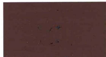
✓ Berry TSR = .29