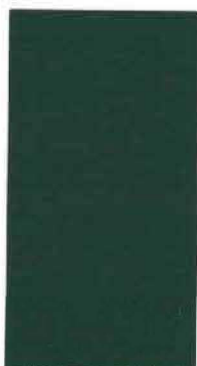
✓ Ivy Green TSR = .28