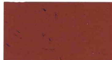
✓ Rustic Red TSR = .34

Sherwin-Williams® and WeatherXL™ are trademarks of SWIMC LLC.