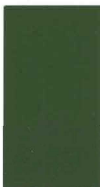
✓ Evergreen TSR = .35