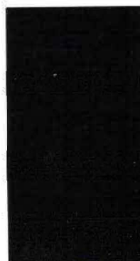
✓ Black TSR = .31