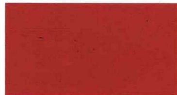
✓ Crimson Red TSR = .31